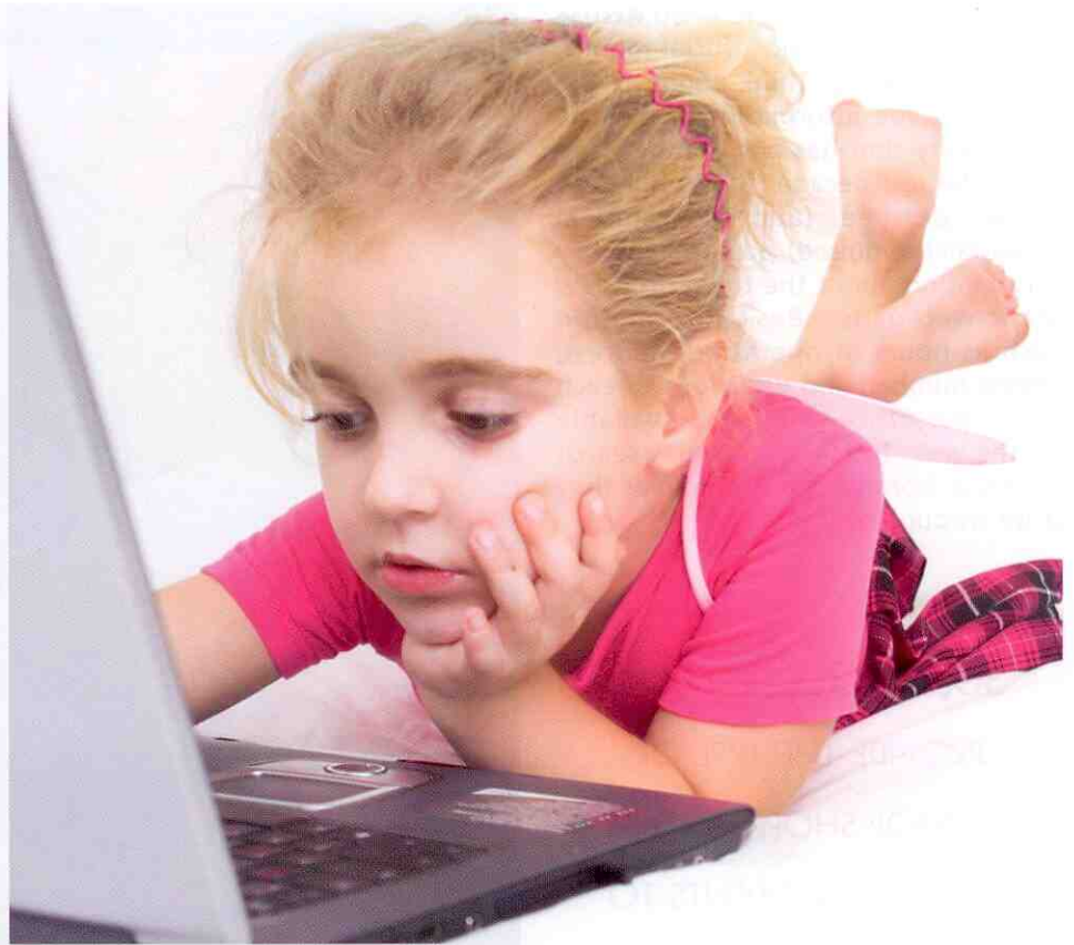
School kids use the internet to research everything; so be sure to include important municipal history and information about the structure of your organization so that they can connect to government at an early age.